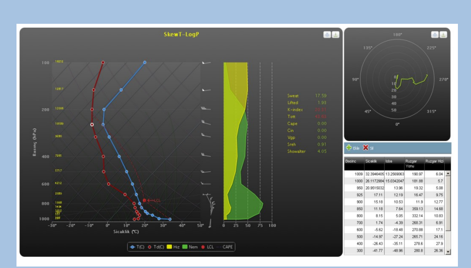
A snapshot view of SKEW-T log P diagram on Interactive Web Page.