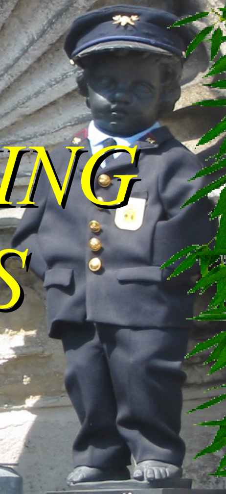
POMPIER 1945 23.02.1945 Brandweerkorps Groot-Abbeville