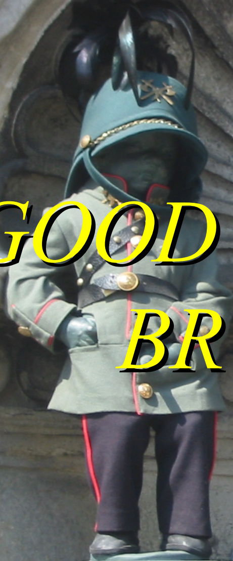
BRANDWEERMAN 1922 27.06.1997 NR127